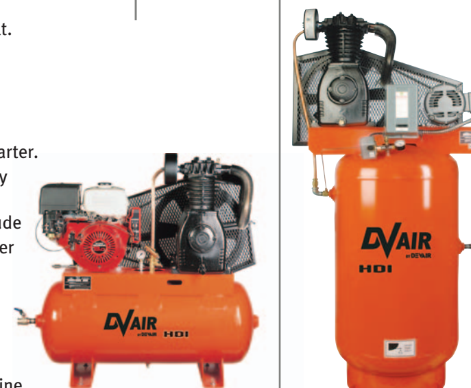
13 hp - Honda gas engine