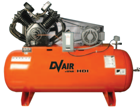
10 hp - 120 gal horizontal air receiver 10HP & 15HP also available with 120 gal vertical air receiver