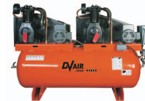
duplex - 120 gal air receiver