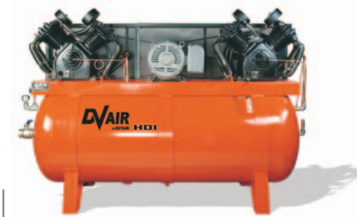
25 & 30 hp - 240 gal air receiver