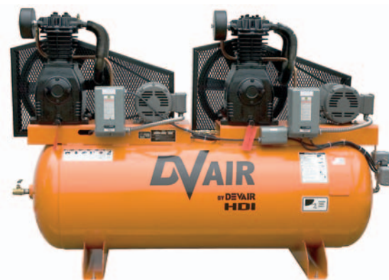
TANK MOUNTED DUPLEX COMPRESSOR