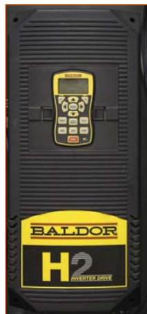
DVS DEVAIR VARIABLE SPEED MODULE

DVS module constantly matches the energy use with air demand, as your air consumption rate changes, DVS will smoothly adjust the motor speed to maximize energy efficiency. The motor and variable speed module are matched to provide optimum performance and reliability at all times.